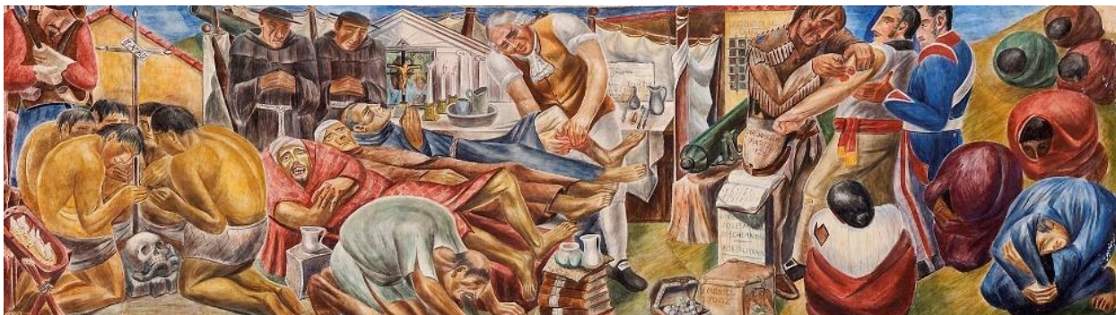
A mural image from Toland Hall